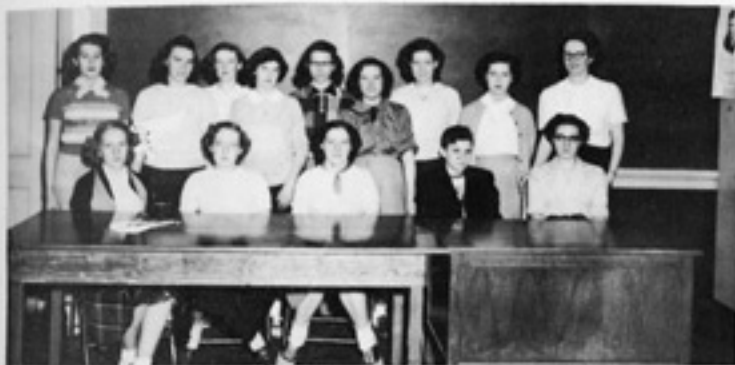
Members of Speech Class