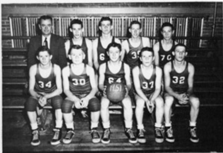
JUNIOR HIGH BASKETBALL TEAM