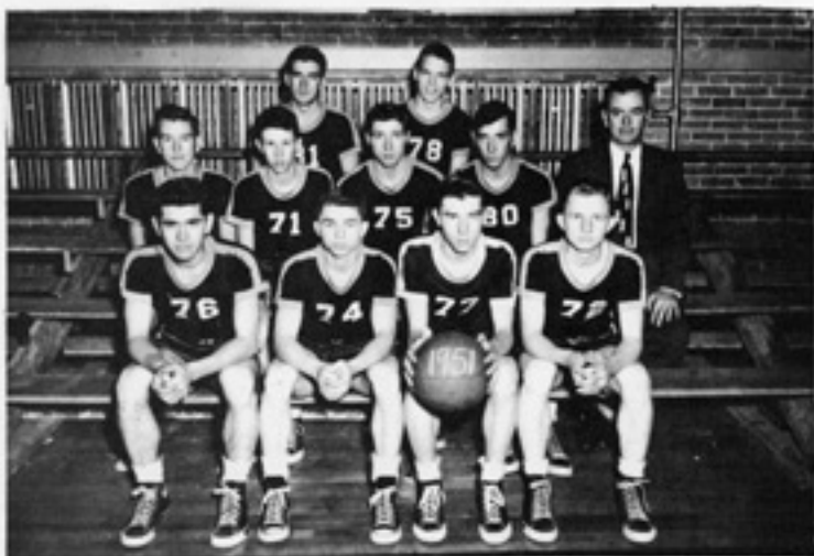
SENIOR HIGH BASKETBALL TEAM