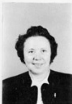
Faye Cooper Primary Grades