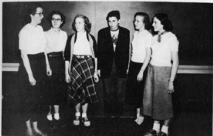
Members of National Forensic League