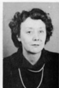
Virginia Sizemore Intermediate Grades